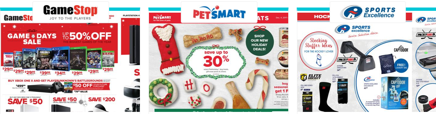
Washington Times-Herald Events